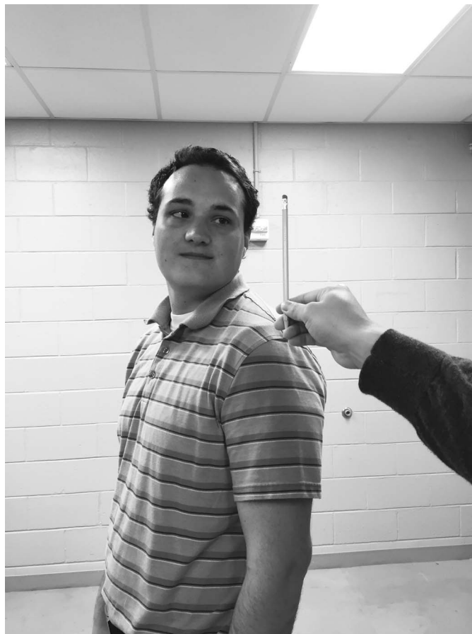
Figure 2. Smooth-pursuit neck-torsion test.

Televan et al 27 recommended adding the SPNTT to the JPET for diagnosing cervical injury. During the SPNTT, patients sit or stand in a neutral position. They actively