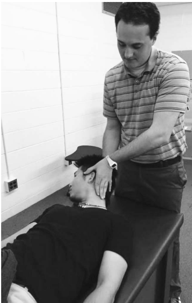
Figure 4. Cervical flexion-rotation test.

symptoms indicates a positive test. If symptoms increase with the test, cervical injury should be considered.