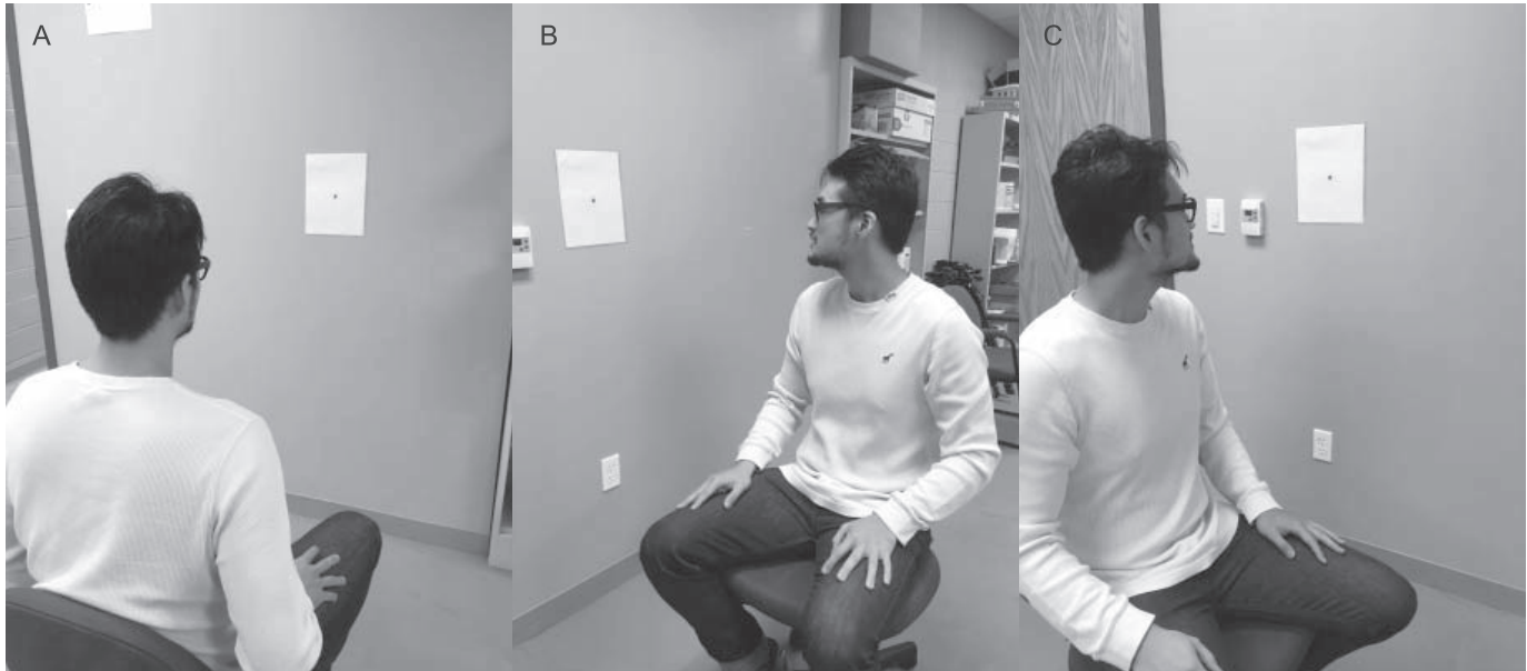
Figure 3. Head-neck differentiation test. A, The patient sits in a chair and looks at a point on the wall. B, The patient holds the head still as C, the clinician rotates the body from under the seat.